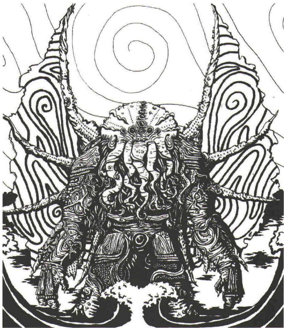
This drawing is titled 'Cthulhu', and was submitted by Joe Coyle – thanks Joe!