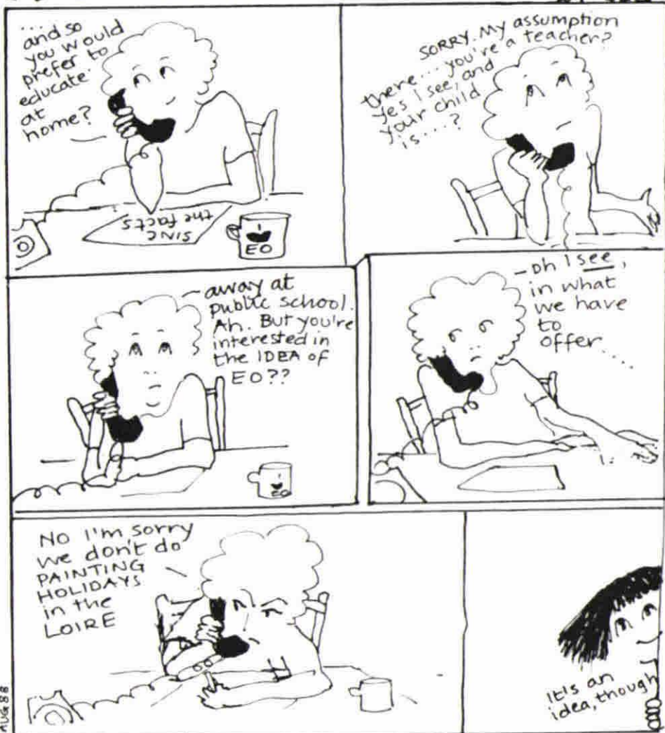
Autumn has always been a busy time for EO's volunteers...

Thirty years on, we still get this sort of enquiry! We would welcome more Helpline volunteers and Local Contacts (formerly known as Co-ordinators) – if you're interested in helping out, contact EO: eenquiries@educationotherwise.org