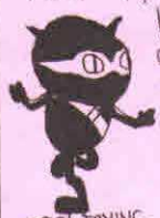
ZOO TRYING TO KEEP HIS BALANCE ON THIS LETTERING