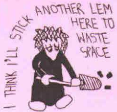
ANOTHER LEM HERE TO WASTE SPACE I THINK I'LL STICK