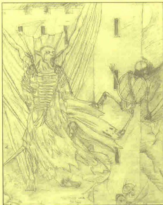
Illustration by Joe Coyle Age 14